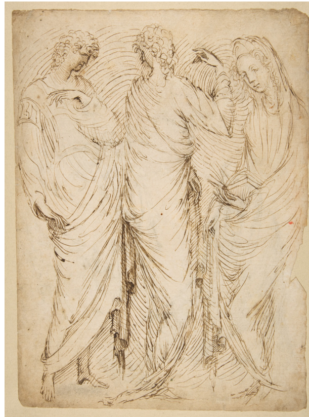
Three Standing Figures, Stefano da Verona 1435–38. Ink. Metropolitan Museum New York