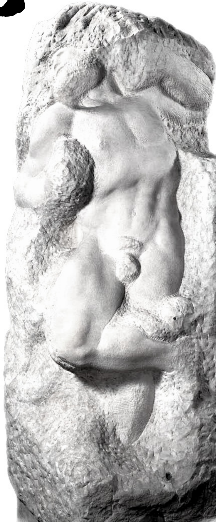
Slave (Awakening) - Michelangelo. Marble, 1519-1536

Michelangelo's described 'releasing' his sculptures of prisoners from the stone. He did not impose them on the marble blocks on which he worked, rather he chiselled away piece by piece all that was needed to reveal the prisoners locked within...